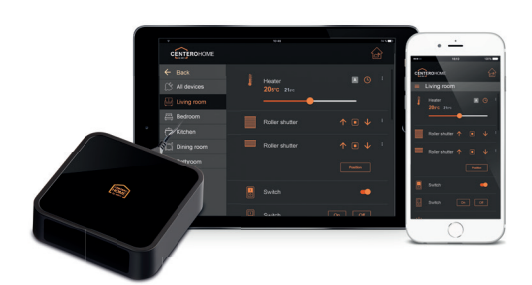
Centero Home Smart home automation

COM hand-held transmitters impress with their modern design and their ergonomic, user-friendly construction. Like the wall-mounted radio transmitters, they are suitable for operating one or more roller shutters and are equipped with the same functions.