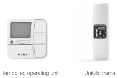
TempoTec operating unit UniClic frame